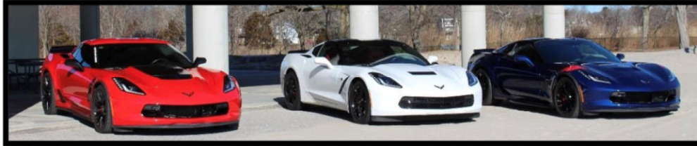
Ocean Beach Park, New London, CT

Hosted by For Corvettes Only, Inc. 15 th Annual Corvette Show