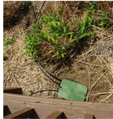
Junction box for 3 zones