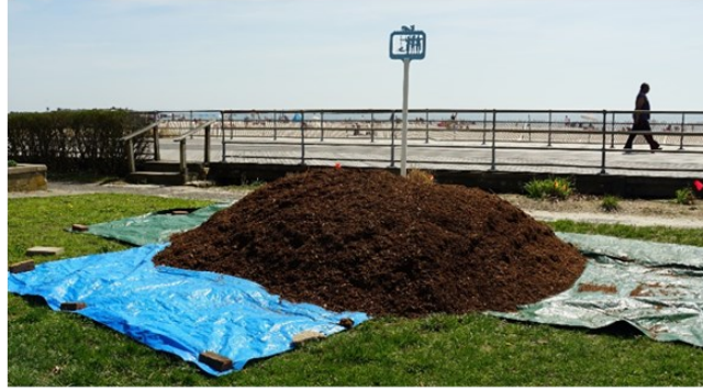
Dumping.....7 cubic yards of mulch