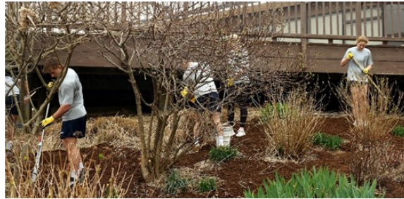
Spread, spread, spread