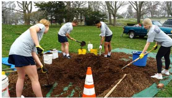
Shovel into buckets