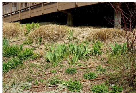
Drip lines.....all over.....