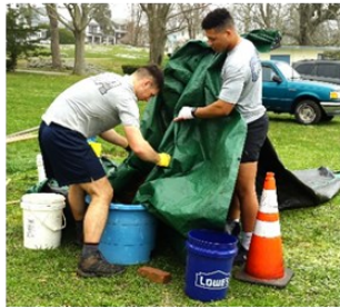
Use every inch of mulch